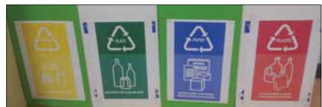
Fig. 2. Establishing recycling bins in the hospital.