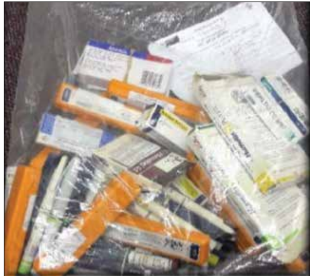
Fig. 3. Medicines returned after expiry date (wasteful expenditure).

The GSH Green Hospital Leadership projects have demonstrated green leadership and environmental responsibility. We were able to engage staff from various levels of the hospital hierarchy to take ownership and drive the project in their areas. The effect and results are regularly disseminated throughout the hospital. In addition, the UCT Private Academic Hospital has joined our going-green projects, in particular by improving recycling and replacing polystyrene with FSC paper-based products. As we aim to engage staff members to work as a team to find solutions to existing problems, we implement